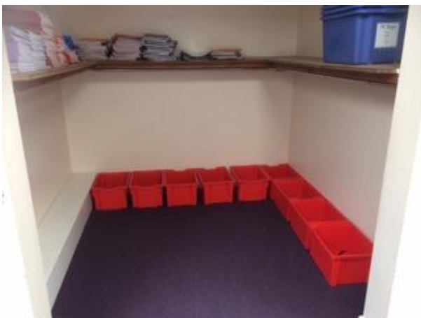
This is where Year 4 hang up their coats and put their PE kits and bags