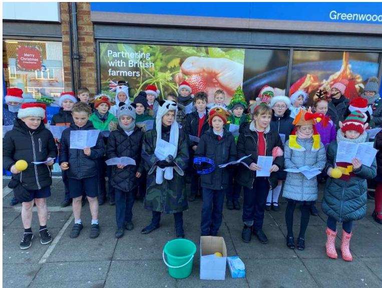
Year 6 Carols