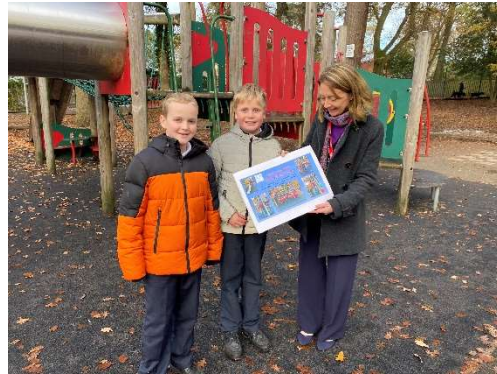
PLT Thank Wellington College for our grant