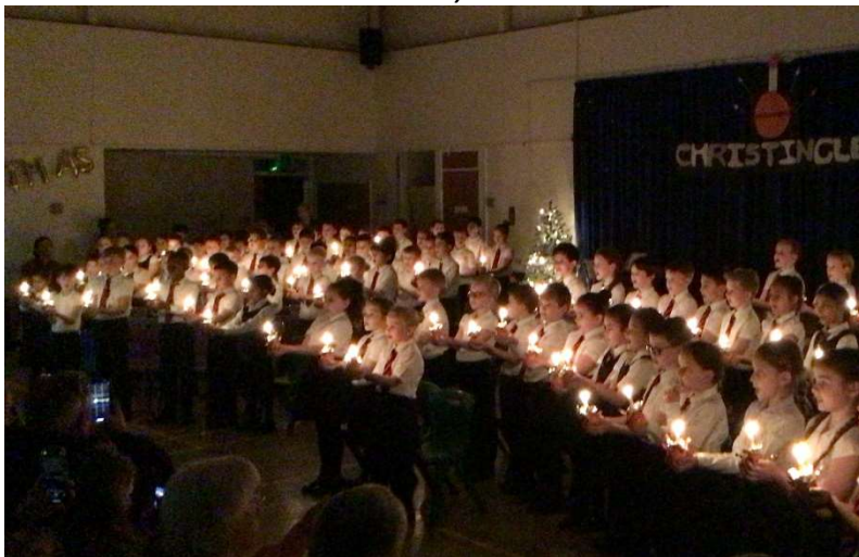
Lighting the candles