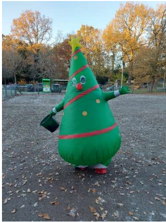
Christmas Jumper Day